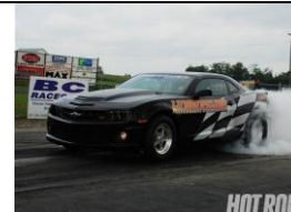
Lingenfelter 2010 Camaro House Car runs high 9s @ 138MPH

The Lingenfelter Collection includes over 150 vehicles that make up one of the greatest car collections in the United States. Join us for a tour of the Lingenfelter private museum, where you will see some of the finest Corvettes, Muscle Cars, and Exotics, including the Bugatti Veyron super car. Our Host, Mike Copeland, will give a presentation on the construction of one-off specialty vehicles. Ken Lingenfelter's custom 1955 Chevrolet pickup (built by Mike) will be the presentation display vehicle. It will be on a hoist to display chassis features and allow total inspection of the vehicle. The guided tour of the museum will follow and will include information on the various vehicles encountered during the tour. Seating at this event will be limited, so be prepared for a considerable amount of standing.