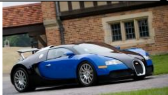
Bugatti Veyron Super Car