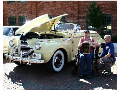
The 2019 Winner - 1940 Buick Super Convertible