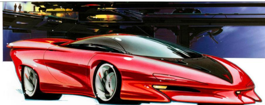
A Tom Peters design sketch 12-87